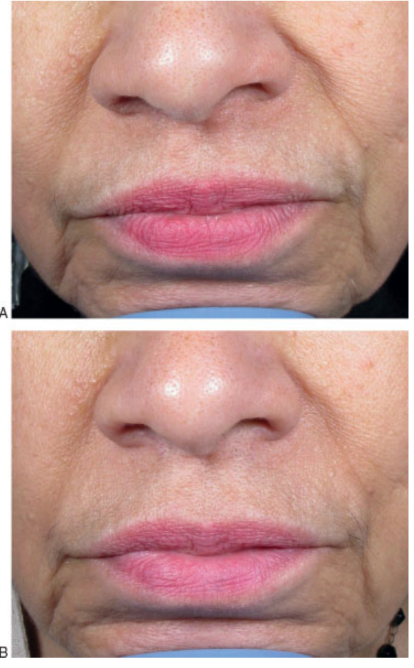
Figure 2 Typical improvement seen after a single Selphyl PRFM treatment of the nasolabial folds. (A) Pretreatment; (B) 12 weeks after treatment.

Treatment of Acne Scars Broad-based, atrophic acne scars can be difficult to treat without significant morbidity, and even with invasive procedures such as dermabrasion, results can be disappointing. Acne scar subcision attempts to divide any fibrous bands tethering the base of the scar to the subdermal tissues using a