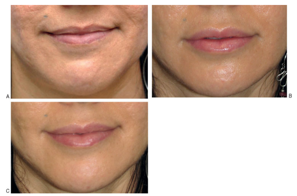
Figure 4 Autologous fat transfer to the lips. Fat was mixed with PRFM in a 2:1 ratio. (A) Pretreatment; (B) 1 week after treatment; (C) 4 weeks after treatment, with little volume loss compared with 1 week posttreatment.

tethering the base of the acne scars are lysed by sweeping the needle and using the sharp edge to cut through these fibers. Without removing the needle from the skin, the PRFM is then injected into the subdermal plane below the acne scars: 2 cc to 4 cc PRFM is